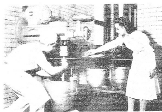
Flyer promoting the role of the hospital dietitian, circa 1950's Roosevelt Hospital, NYC