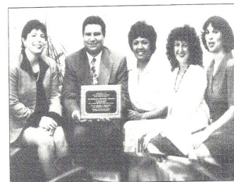
NYSDA Legislative Leaders, 1996.