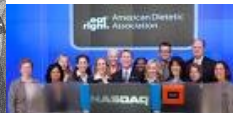
NYSDA members ring NASDAQ opening bell